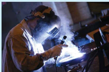
Monitoring worker exposure to airborne contaminants