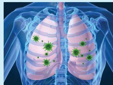
Particulate Matter study